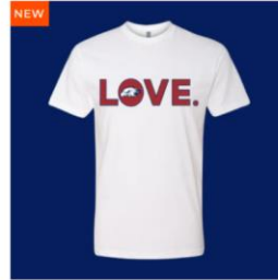
2024 EAGLE ADULT & YOUTH SHORT SLEEVE SPIRIT TEE PREORDER

PRE ORDER DATES: August 28, 2024– September 8, 2024