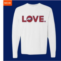
2024 EAGLE ADULT LONG SLEEVE COMFORT COLORS SPIRIT TEE PREORDER